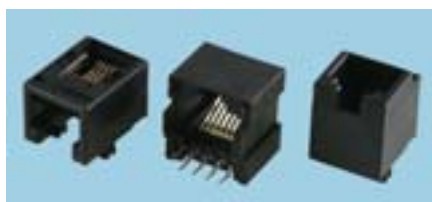
Low profile 90° Bottom entry Vertical