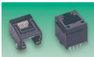
Right angle Vertical